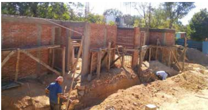
The first two rehearsal rooms will be ready in May!