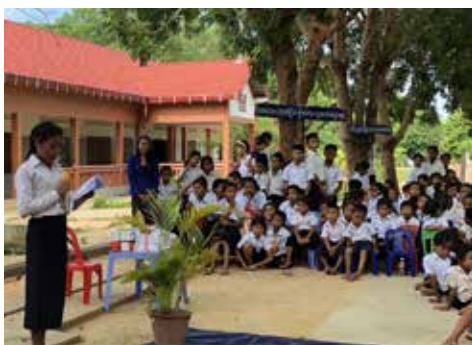
Soon we can say "The Ta Pen school has helped produce senior high school graduates for Cambodia"

This year, for the first time, and thanks to the amazing commitment of all the friends of