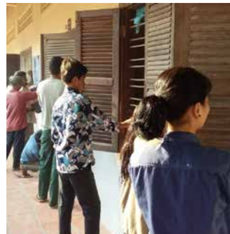
The school has had a facelift thanks to a communal effort

The Ta Pen school is ten years old – as is its woodwork! Some maintenance was greatly needed to avoid it becoming run-down. Sanding and repainting the doors and shutters of the five-classroom school was an enormous task for our two handymen. So, in January, the class 9 pupils and some of the parents and teachers came to lend a hand during the weekends. And it was "mission accomplished" before the period of very warm weather began. The school is looking lovely and everyone is very proud of it! Many thanks to all involved.